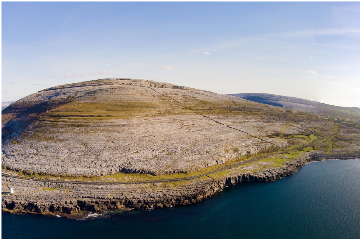
Black Head and Gleninagh Mountain in The Burren

The Burren covers approximately 1% of the land surface of Ireland at around 350km 2 .