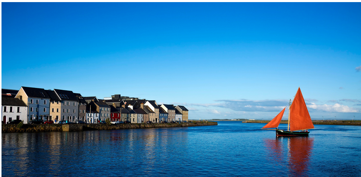
A Galway Hooker, a traditional wood, canvas and tar fishing vessel, sails past the Long Walk in Galway City

Galway is the capital city of the West of Ireland, in the province of Connacht. A vibrant, friendly and colourful city, recognised worldwide for its welcoming atmosphere, historic streetscapes, beautiful coastal views and thriving arts and cultural scene. It is also a rather small city, and it is possible to walk from one side of the city area in the east to the other in the west in little more than an hour. The charming and lively character of Galway's streets, shopping and nightlife make it one of Ireland's most popular destinations for families and lovers of nature and culture. The City is home to the University of Galway , part of the National University of Ireland and one of Europe's leading universities studying the social, cultural, and economic dimensions of biodiversity.