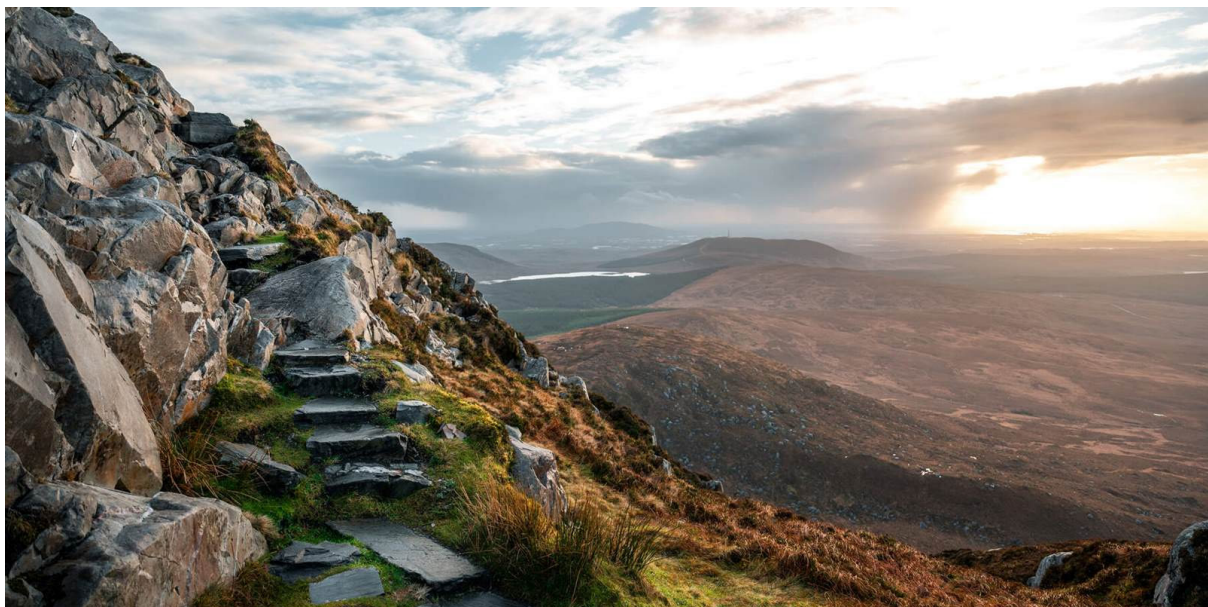
View from Diamond Head mountain, Connemara

The landscape of Connemara has been made famous internationally through cinema, music, literature and song. Its mix of rolling hills, exposed rocky slopes, blanket bogs, forests, lakes and pasture have been created by a complex geology of sedimentary, igneous and metamorphic processes.